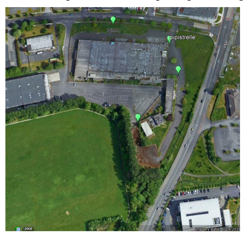
Pipistrelle feeding activity on the site