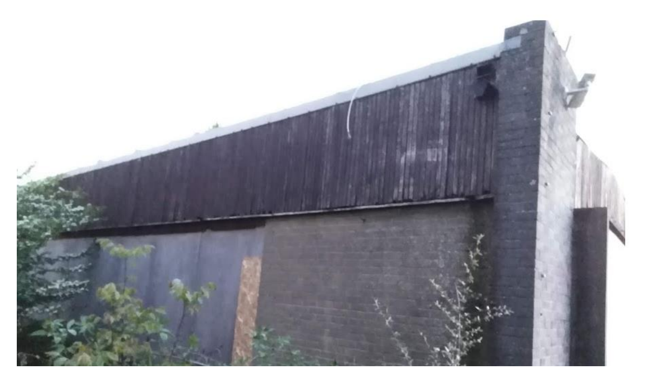
This timber panelling is suitable for bat usage and there was a lot of bat activity around it during the night.

The survey commenced at 20.15 when the inside of the building was checked for bats. Much of this building is in poor repair and is unsuitable for bats. However, at the rear of the building is some timber panelling with cracks and crevices. This is suitable for bat usage.