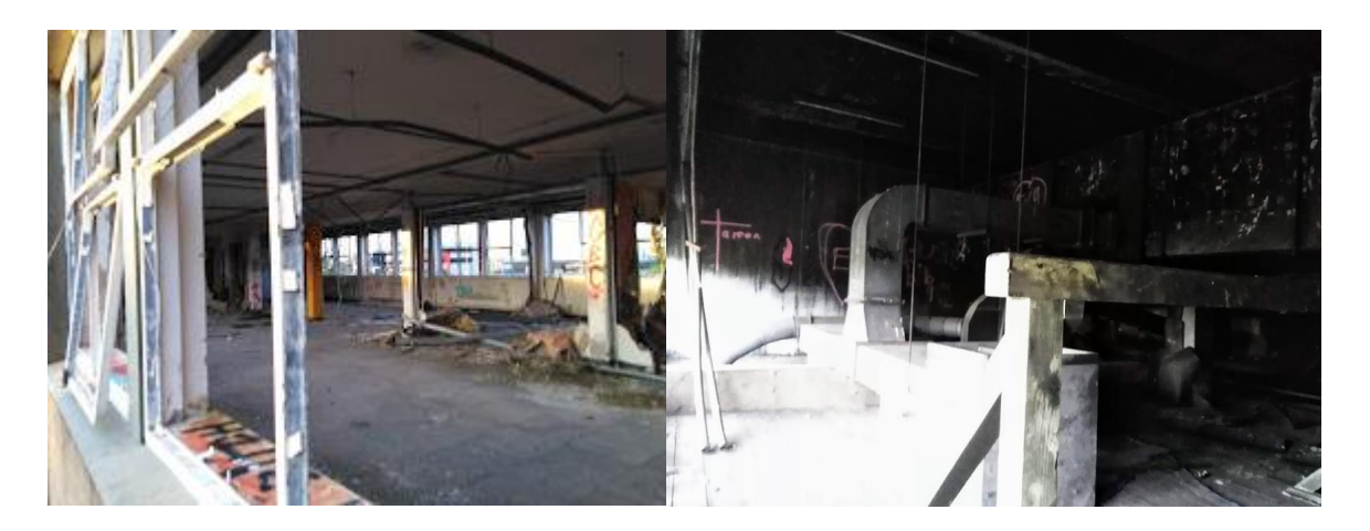
Most of the internal parts of the factory building are unsuitable for bat usage.