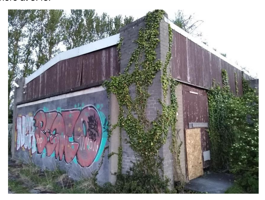
Bats were feeding around this building throughout the night

At 23.20 a soprano pipistrelle was recorded in the south western part of the site. Common pipistrelles were recorded by the timbers at 2.30, and a Leisler's bat was recorded here at 3.43.